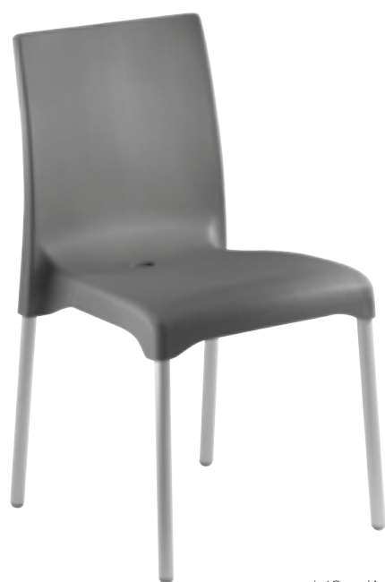
cod. 13.-- /A